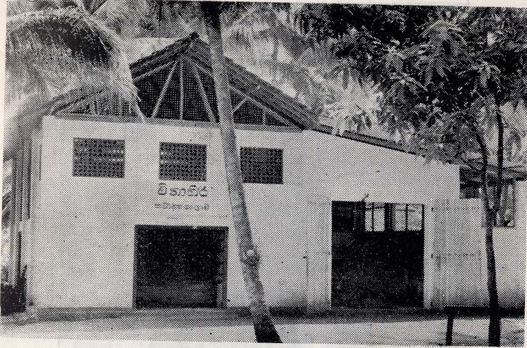
The New Vinegar Factory