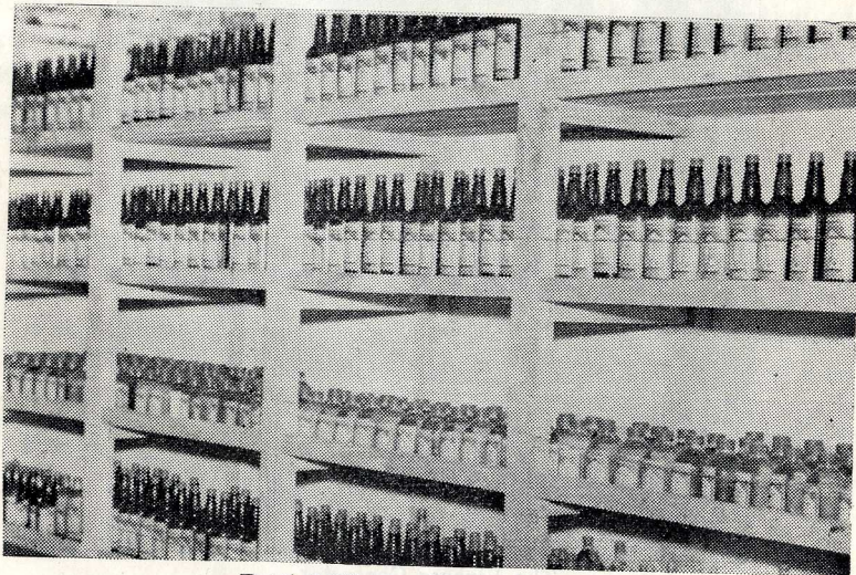
Bottled Vinegar Ready For Sale