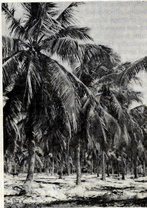
Coconut plantation in a class 4 land

Soil characteristics, agro - climatic conditions and the potential crop yield employed for defining each of the suitability class are given in Table 1.