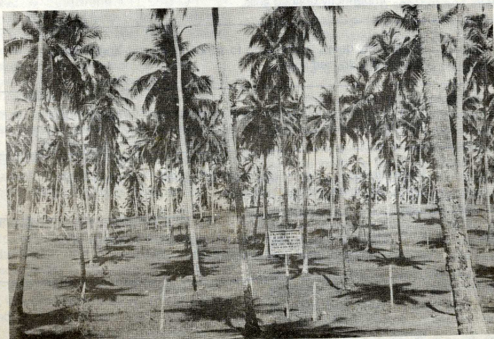
Coconut plantation in a class 5 land