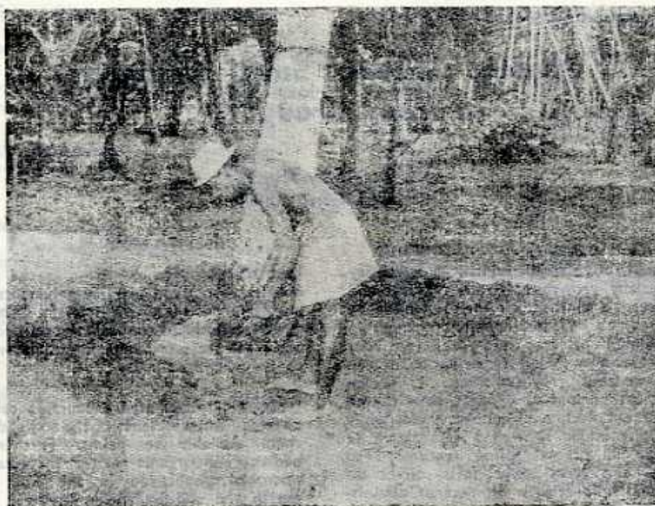
Organic manure application to a palm

The quantities of organic and the inorganic fertilizer that combine to derive the above nutrient requirements are :—