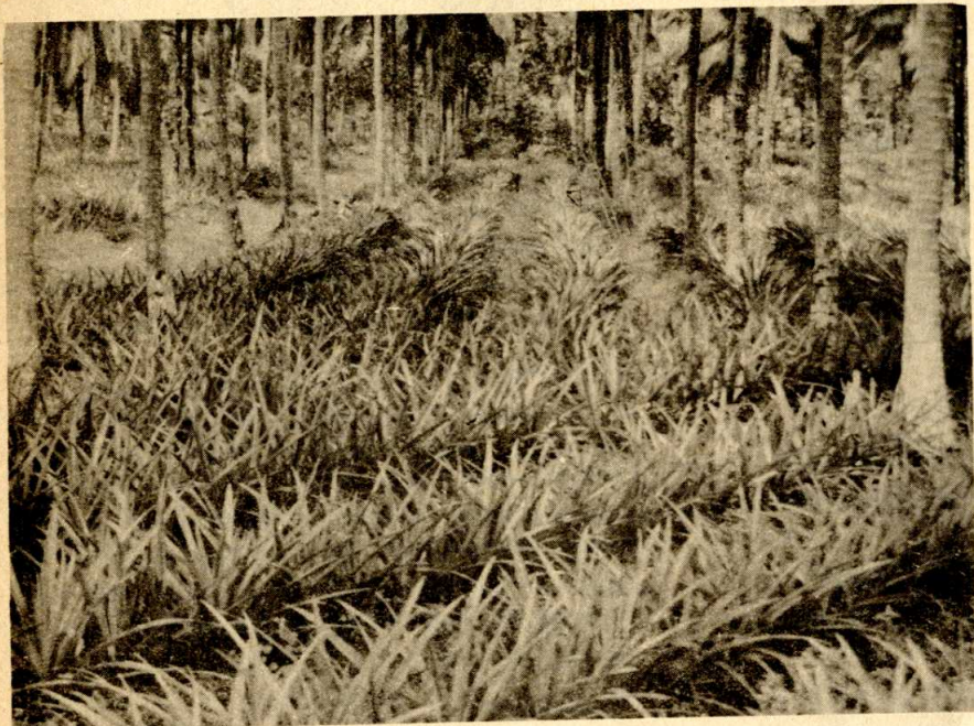
Pineapple under coconut.

in a slopy land, they are tilted towards the upper side of the slope but when the crowns are planted, they are planted erect. For the control of fungal diseases and pests such as mealy bugs, the planting material should be treated before planting with an insecticide such as Lebaycide or Tamaron. This is very important for areas with heavy rainfall.