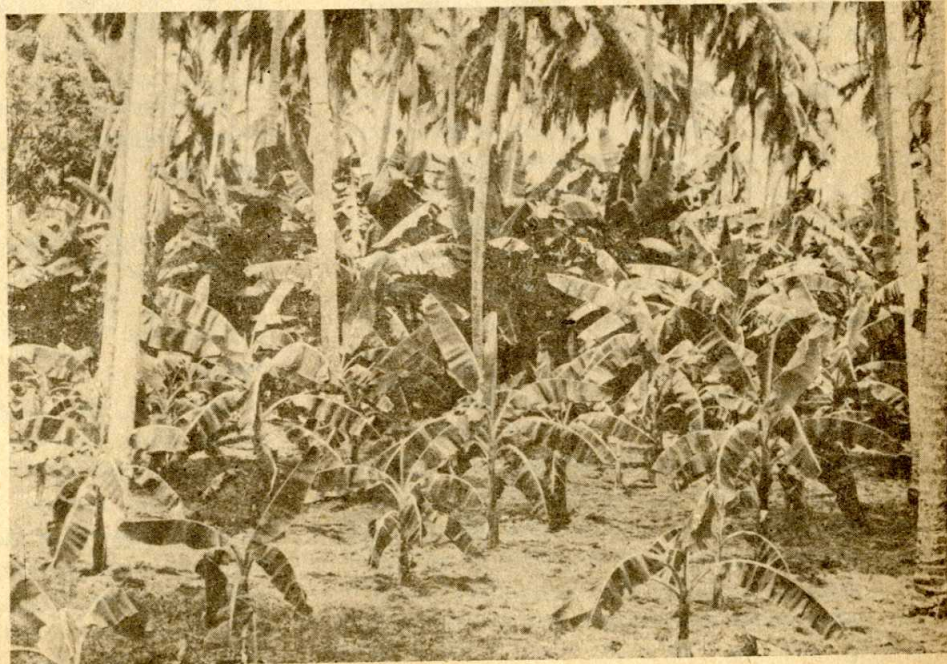
Banana as an intercrop.

Segments of the under ground stem should be separated one bud in each. These segments are first grown in the nursery and later transplanted.